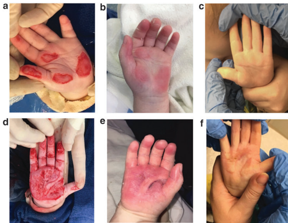
Figure 3. Full-thickness hand burns to fingers bilaterally ( a, d ) initial debridement, ( b, e ) complete healing postop day 38, ( c, f ) postop day 115 with no contractures and minimal scarring.

biosynthetics (Integra, Apligraf, and Dermagraft). To date, few randomized-controlled trials have compared the efficacy of these allografts in pediatric burns. Cadaveric skin has posed a number of obstacles not limited to potential disease transmission and psychologic rejection of donor skin due to potential differences in skin tone. In a longitudinal assessment of Integra in primary burn management, Integra resulted in better cosmesis compared with autograft–allograft treatment. 57 Many of these products involve only a dermal layer; patients must still be autografted after treatment due to the lack of an epidermal layer. Apligraf contains an epidermal layer, but its major adverse