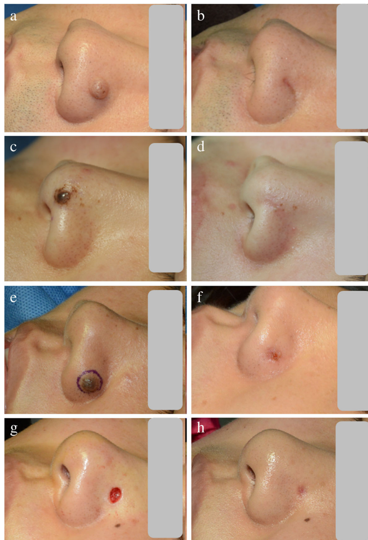
Fig. 3 Representative cases of the use of human acellular amniotic membrane (HAAM) for the wound healing at different locations. a, c, e, g Before HAAM implantation; b, d, f, h 1 month after HAAM treatment

alpha-smooth muscle actin [36]. Even though the AM was solubilised, the acceleration of the wound closure and prevention of the wound contraction was recorded in a full-thickness murine wound model [21]. The above findings in animals suggest encouraging outcomes of HAAM for the lower third nasal reconstruction in humans in this study. Although the dehydrated AM has been reported to treat traumatic wounds to the nasal tip in one case [16], our study is the first randomised controlled trial to investigate the feasibility of HAAM in the treatment of circular skin defects for nasal reconstruction and to demonstrate excellent healing with minimal aesthetic impact.